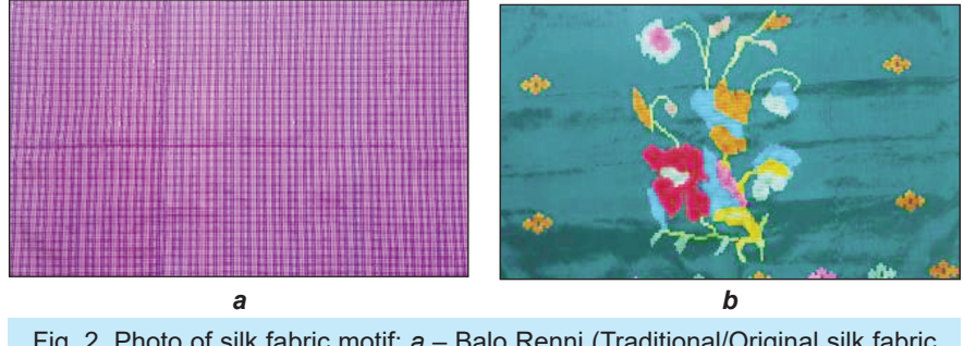
Fig. 2. Photo of silk fabric motif: a – Balo Renni (Traditional/Original silk fabric motif); b – Lagosi Motifs (Modification silk cloth motif)

Silk product marketing in Wajo Regency is marketed through various media, starting from individual marketing, exhibitions to online marketplaces such as the internet, web, and social media. Thus, marketing is more practical. Utilizing online marketplaces in business activities can increase sales [30], thereby encouraging sellers to effectively integrate themselves into the global marketplace [31]. The use of social media can increase marketing, and online marketing has a positive impact on the marketing of the textile industry [32]. The internet changed the way silk entrepreneurs did business, making it easier for customers to access and select items to buy anytime and anywhere [33]. In addition, silk entrepreneurs who have good skills and are willing to innovate will